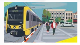
West Santa Ana Branch Transit Corridor