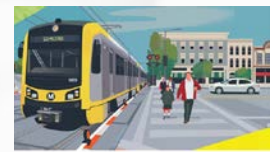
West Santa Ana Branch Transit Corridor