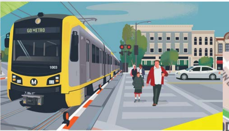
West Santa Ana Branch Transit Corridor